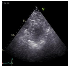
Original image \gamma 0.5, \kappa 151, c 7

Results: Twenty-six images of 11 patients were taken to this software and 15 images were successfully made noise-free. These renewed images were possible to be analyzed by strain or strain rate method. But eleven images failed to be noise-free enough to be analyzed precisely.